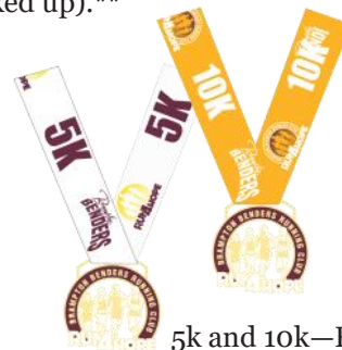
5k and 10k—Race Medals